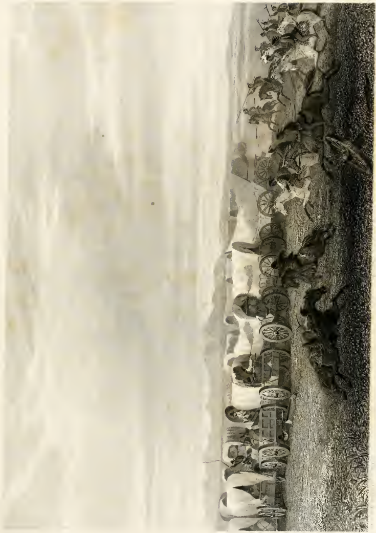
STAGECOACH COMPANY, 1866. (1866-1867) STAGECOACH COMPANY, 1866-1867.